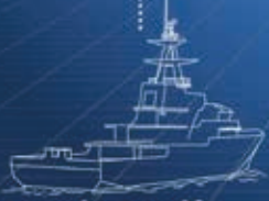
KraitStrike Lightweight Torpedo Launcher