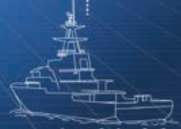
KraitShield Acoustic Decoy System