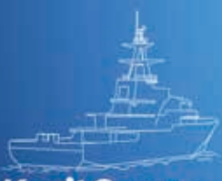
KraitSense Passive Towed Array