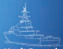
KraitSearch Active Acoustic Search